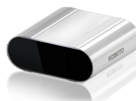
Example: KOMOTO's M3 enclosure