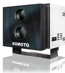
Example: KOMOTO's C36 enclosure